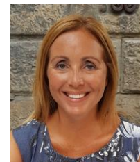
A message from the Primary Cluster Headteacher